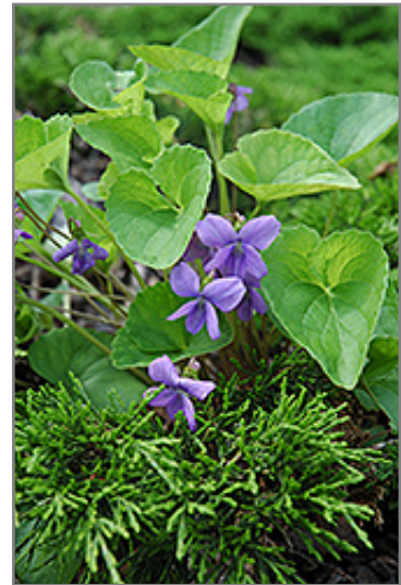
Wooly Blue Violet flowers