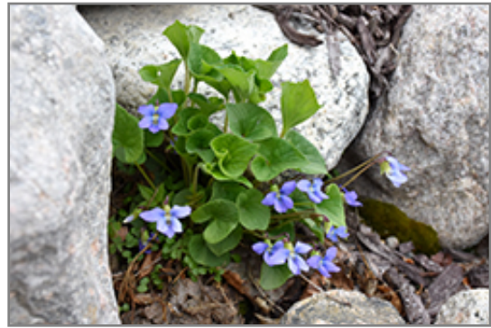
Woolly Blue Violet in bloom

Woolly Blue Violet will grow to be only 4 inches tall at maturity extending to 6 inches tall with the flowers, with a spread of 6 inches. When grown in masses or used as a bedding plant, individual plants should be spaced approximately 5 inches apart. Its foliage tends to remain low and dense right to the ground. It grows at a fast rate, and under ideal conditions can be expected to live for approximately 3 years. As an herbaceous perennial, this plant will usually die back to the crown each winter, and will regrow from the base each spring. Be careful not to disturb the crown in late winter when it may not be readily seen!