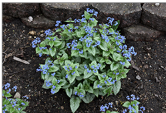
Sterling Silver Bugloss in bloom