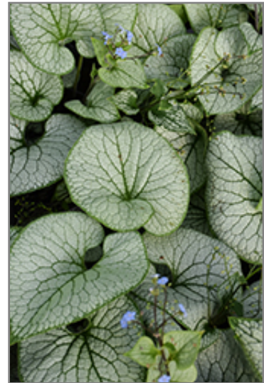
Sterling Silver Bugloss foliage

Sterling Silver Bugloss is a fine choice for the garden, but it is also a good selection for planting in outdoor pots and containers. It is often used as a 'filler' in the 'spiller-thriller-filler' container combination, providing a mass of flowers and foliage against which the thriller plants stand out. Note that when growing plants in outdoor containers and baskets, they may require more frequent waterings than they would in the yard or garden. Be aware that in our climate, most plants cannot be expected to survive the winter if left in containers outdoors, and this plant is no exception. Contact our experts for more information on how to protect it over the winter months.