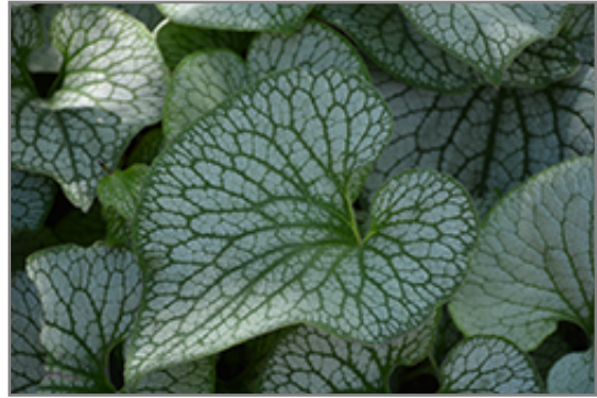
Sterling Silver Bugloss foliage

Sterling Silver Bugloss is a fine choice for the garden, but it is also a good selection for planting in outdoor pots and containers. It is often used as a 'filler' in the 'spiller-thriller-filler' container combination, providing a mass of flowers and foliage against which the thriller plants stand out. Note that when growing plants in outdoor containers and baskets, they may require more frequent waterings than they would in the yard or garden. Be aware that in our climate, most plants cannot be expected to survive the winter if left in containers outdoors, and this plant is no exception. Contact our experts for more information on how to protect it over the winter months.