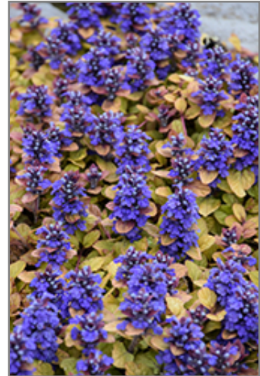
Feathered Friends Parrot Paradise Bugleweed in bloom

Feathered Friends Parrot Paradise Bugleweed is a dense herbaceous evergreen perennial with a ground-hugging habit of growth. Its relatively fine texture sets it apart from other garden plants with less refined foliage.