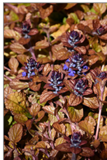
Feathered Friends Parrot Paradise Bugleweed flowers