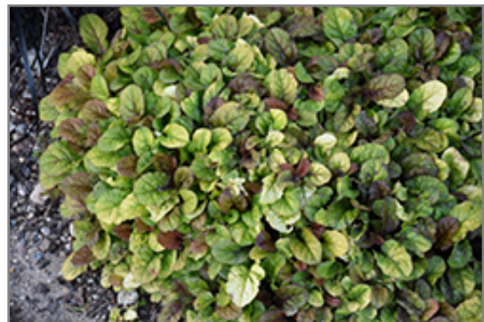
Feathered Friends Parrot Paradise Bugleweed