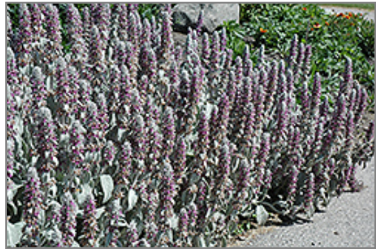
Lamb's Ears in bloom

Lamb's Ears will grow to be about 12 inches tall at maturity extending to 24 inches tall with the flowers, with a spread of 18 inches. When grown in masses or used as a bedding plant, individual plants should be spaced approximately 15 inches apart. Its foliage tends to remain dense right to the ground, not requiring facer plants in front. It grows at a fast rate, and under ideal conditions can be expected to live for approximately 10 years. As an herbaceous perennial, this plant will usually die back to the crown each winter, and will regrow from the base each spring. Be careful not to disturb the crown in late winter when it may not be readily seen!