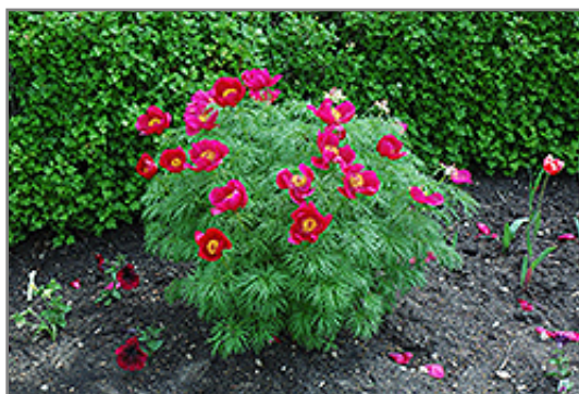
Fernleaf Peony in bloom