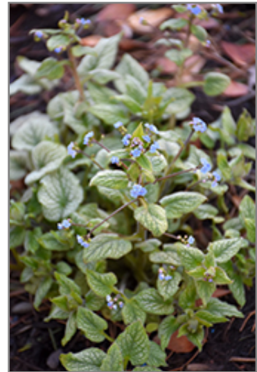
Alchemy Pewter Bugloss flowers

Alchemy Pewter Bugloss is a fine choice for the garden, but it is also a good selection for planting in outdoor pots and containers. It is often used as a 'filler' in the 'spiller-thriller-filler' container combination, providing a mass of flowers and foliage against which the thriller plants stand out. Note that when growing plants in outdoor containers and baskets, they may require more frequent waterings than they would in the yard or garden. Be aware that in our climate, most plants cannot be expected to survive the winter if left in containers outdoors, and this plant is no exception. Contact our experts for more information on how to protect it over the winter months.