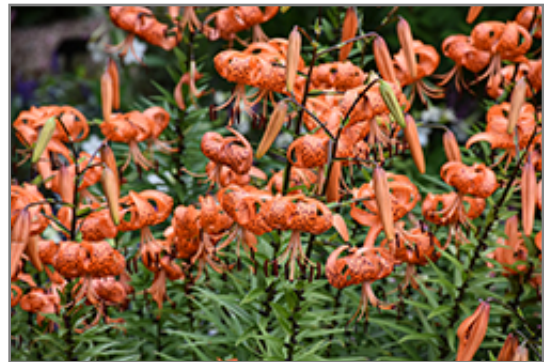
Tiger Lily flowers