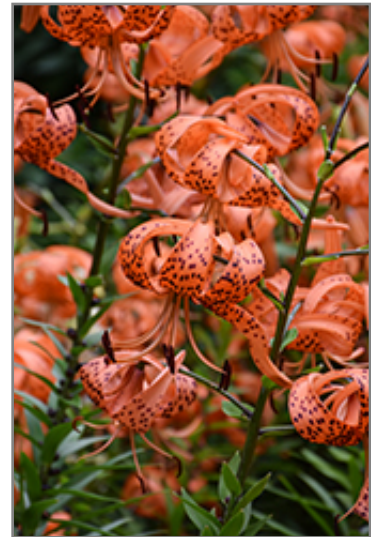
Tiger Lily flowers