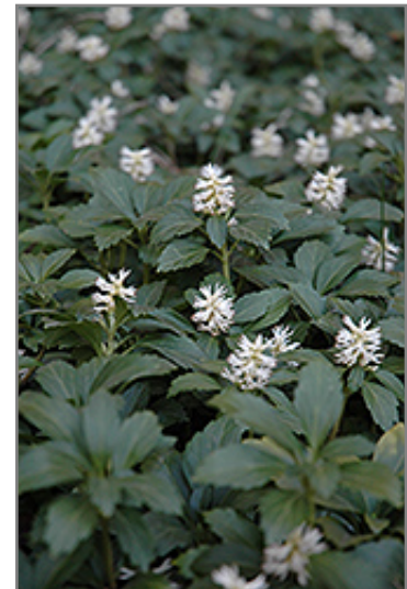
Japanese Spurge flowers