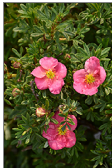
Bella Bellissima Potentilla flowers