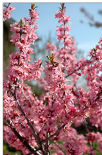
Muckle Plum flowers