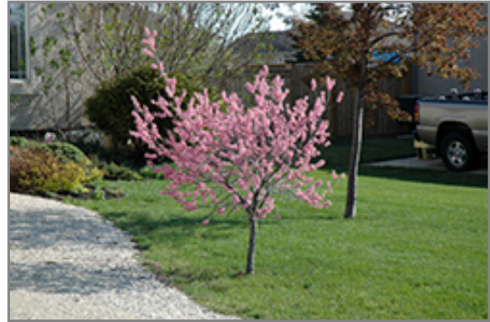
Muckle Plum in bloom

This shrub should only be grown in full sunlight. It does best in average to evenly moist conditions, but will not tolerate standing water. It is not particular as to soil type or pH. It is highly tolerant of urban pollution and will even thrive in inner city environments. This particular variety is an interspecific hybrid.