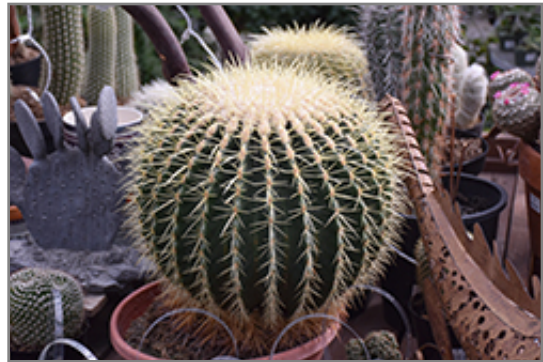
Golden Barrel Cactus in full

Golden Barrel Cactus is a succulent evergreen plant. It is a member of the cactus family, which are grown primarily for their characteristic shapes, their interesting features and textures, and their high tolerance for hot, dry growing environments. Like all cacti, it doesn't actually have leaves, but rather modified succulent stems that comprise the bulk of the plant, and which are designed to hold water for long periods of time. This particular cactus is valued for its distinctive barrel shape, and usually grows as a single spiny ribbed green stem. This plant has yellow cup-shaped flowers held atop the stems from late spring to early summer, which are interesting on close inspection.