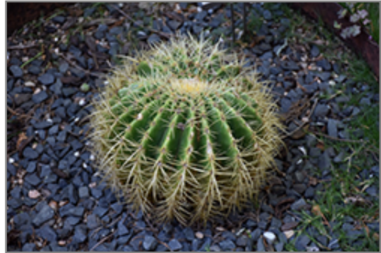
Golden Barrel Cactus

Golden Barrel Cactus is a succulent evergreen plant. It is a member of the cactus family, which are grown primarily for their characteristic shapes, their interesting features and textures, and their high tolerance for hot, dry growing environments. Like all cacti, it doesn't actually have leaves, but rather modified succulent stems that comprise the bulk of the plant, and which are designed to hold water for long periods of time. This particular cactus is valued for its distinctive barrel shape, and usually grows as a single spiny ribbed green stem. This plant has yellow cup-shaped flowers held atop the stems from late spring to early summer, which are interesting on close inspection.