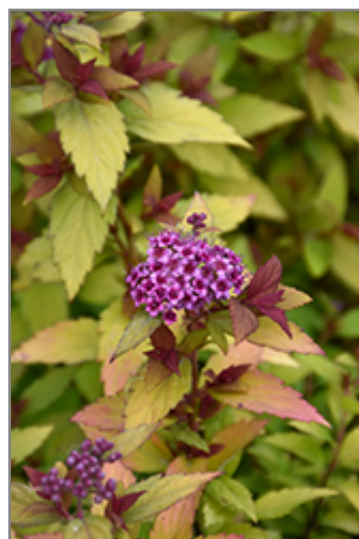
Poprocks Rainbow Fizz Spirea flowers