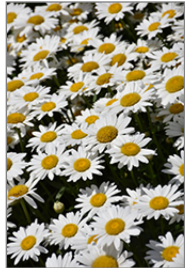
Becky Shasta Daisy flowers