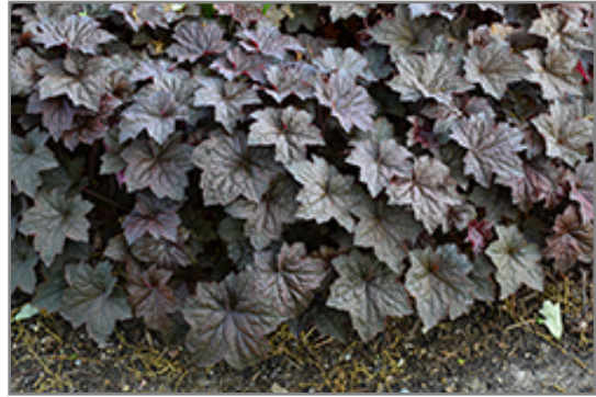
Palace Purple Coral Bells

Palace Purple Coral Bells will grow to be about 12 inches tall at maturity extending to 24 inches tall with the flowers, with a spread of 12 inches. When grown in masses or used as a bedding plant, individual plants should be spaced approximately 10 inches apart. Its foliage tends to remain dense right to the ground, not requiring facer plants in front. It grows at a medium rate, and under ideal conditions can be expected to live for approximately 10 years. As an evergreen perennial, this plant will typically keep its form and foliage year-round.