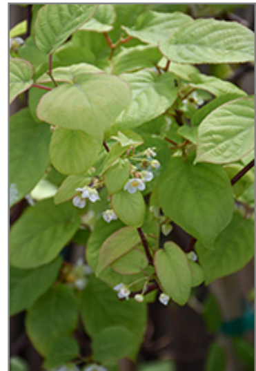
Variegated Hardy Kiwi Vine flowers