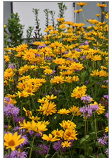
Summer Sun False Sunflower flowers