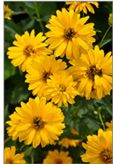
Summer Sun False Sunflower flowers

Summer Sun False Sunflower is recommended for the following landscape applications;