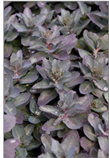
Cherry Truffle Stonecrop foliage

Cherry Truffle Stonecrop is a fine choice for the garden, but it is also a good selection for planting in outdoor pots and containers. It is often used as a 'filler' in the 'spiller-thriller-filler' container combination, providing a mass of flowers and foliage against which the larger thriller plants stand out. Note that when growing plants in outdoor containers and baskets, they may require more frequent waterings than they would in the yard or garden. Be aware that in our climate, most plants cannot be expected to survive the winter if left in containers outdoors, and this plant is no exception. Contact our experts for more information on how to protect it over the winter months.