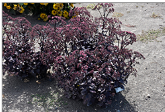
Cherry Truffle Stonecrop in bloom