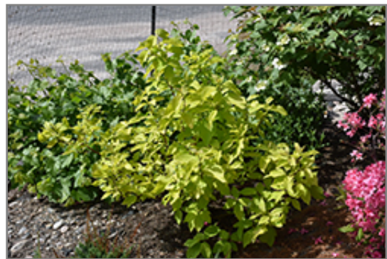
Neon Burst Dogwood