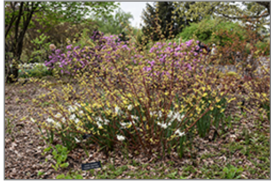
Neon Burst Dogwood in spring

This shrub does best in full sun to partial shade. It is an amazingly adaptable plant, tolerating both dry conditions and even some standing water. It is not particular as to soil type or pH. It is highly tolerant of urban pollution and will even thrive in inner city environments. This is a selected variety of a species not originally from North America.