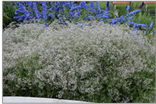
Common Baby's Breath in bloom