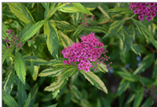
Double Play Painted Lady Spirea flowers