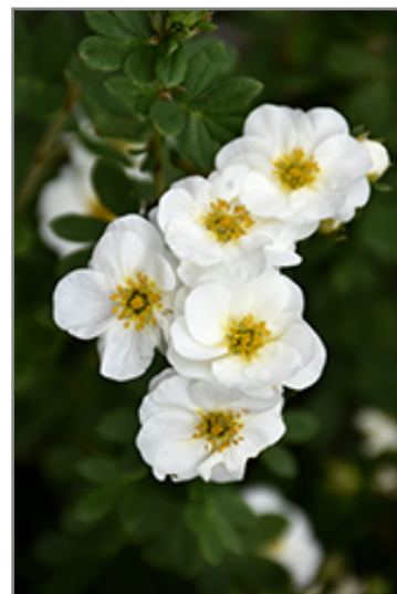
Creme Brulee Potentilla flowers