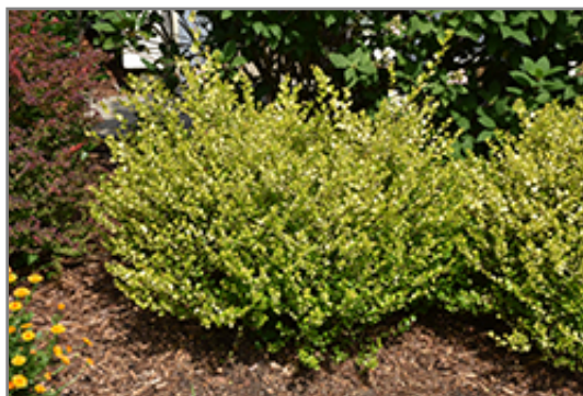
Cesky Gold Dwarf Birch