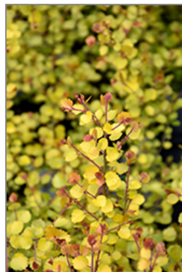
Cesky Gold Dwarf Birch foliage