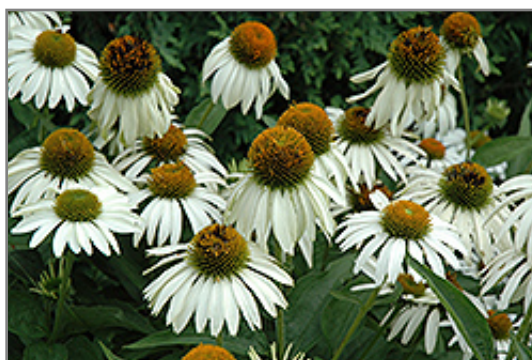
White Swan Coneflower flowers

White Swan Coneflower is recommended for the following landscape applications;