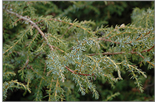
Common Juniper foliage