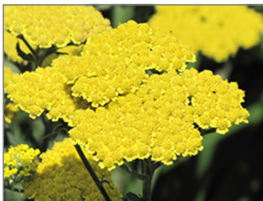
Moonshine Yarrow flowers

Moonshine Yarrow is recommended for the following landscape applications;