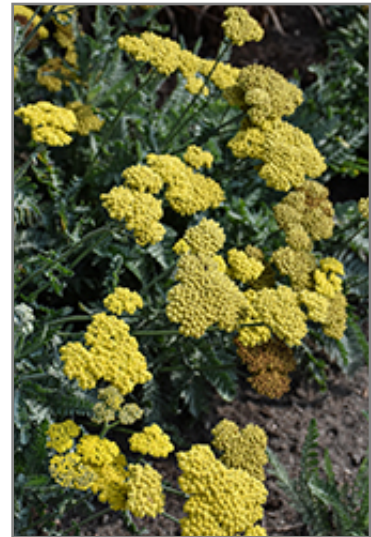
Moonshine Yarrow flowers

Moonshine Yarrow is a fine choice for the garden, but it is also a good selection for planting in outdoor pots and containers. It can be used either as 'filler' or as a 'thriller' in the 'spiller-thriller-filler' container combination, depending on the height and form of the other plants used in the container planting. It is even sizeable enough that it can be grown alone in a suitable container. Note that when growing plants in outdoor containers and baskets, they may require more frequent waterings than they would in the yard or garden. Be aware that in our climate, most plants cannot be expected to survive the winter if left in containers outdoors, and this plant is no exception. Contact our experts for more information on how to protect it over the winter months.