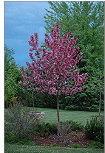
Rudolph Flowering Crab in bloom