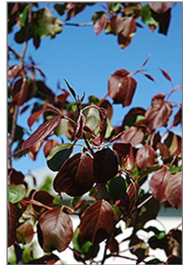
Rudolph Flowering Crab foliage

This tree should only be grown in full sunlight. It prefers to grow in average to moist conditions, and shouldn't be allowed to dry out. It is not particular as to soil type or pH. It is highly tolerant of urban pollution and will even thrive in inner city environments. This particular variety is an interspecific hybrid.