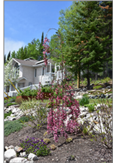
Royal Beauty Flowering Crab in bloom

* This is a 'special order' plant - contact store for details