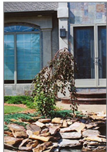
Royal Beauty Flowering Crab