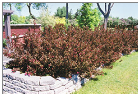
Wine and Roses Weigela