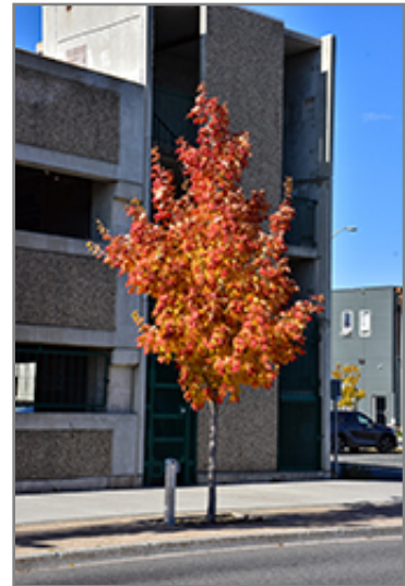
Lord Selkirk Sugar Maple in fall

Lord Selkirk Sugar Maple will grow to be about 40 feet tall at maturity, with a spread of 30 feet. It has a high canopy with a typical clearance of 7 feet from the ground, and should not be planted underneath power lines. As it matures, the lower branches of this tree can be strategically removed to create a high enough canopy to support unobstructed human traffic underneath. It grows at a slow rate, and under ideal conditions can be expected to live for 80 years or more.