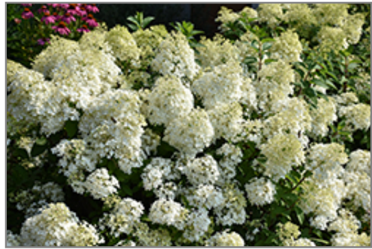
Bobo Hydrangea flowers