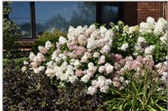
Bobo Hydrangea in bloom