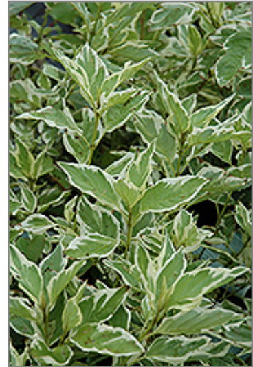
Silver and Gold Dogwood foliage

This shrub does best in full sun to partial shade. It is an amazingly adaptable plant, tolerating both dry conditions and even some standing water. It is not particular as to soil type or pH. It is highly tolerant of urban pollution and will even thrive in inner city environments. This is a selection of a native North American species.