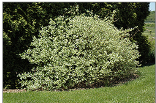
Silver and Gold Dogwood