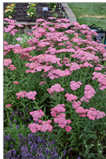
New Vintage Rose Yarrow in bloom