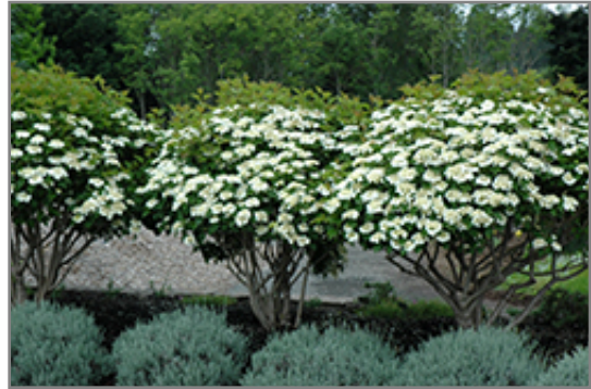
Compact European Cranberry in bloom