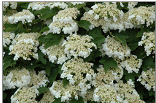
Compact European Cranberry flowers