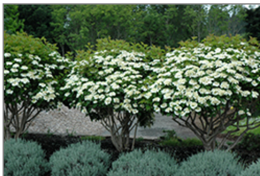
Compact European Cranberry in bloom