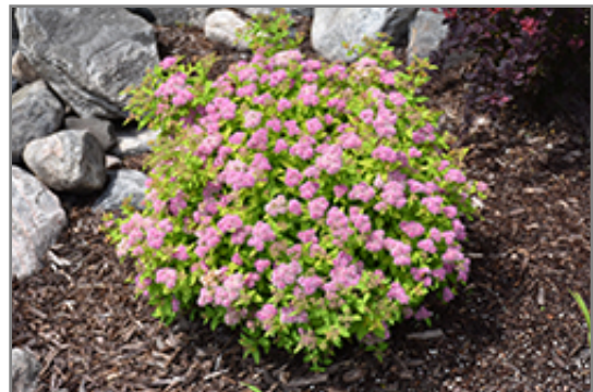
Dakota Goldcharm Spirea in bloom