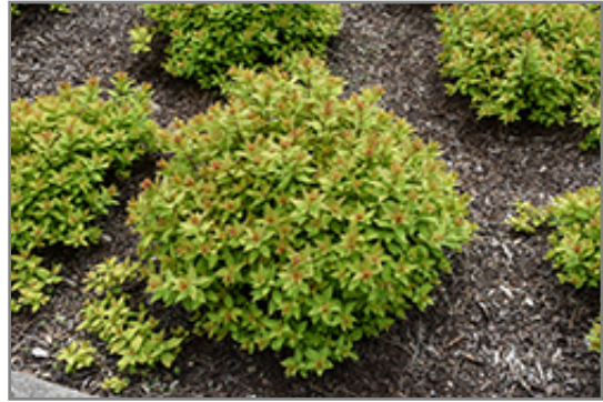
Dakota Goldcharm Spirea

This shrub should only be grown in full sunlight. It prefers to grow in average to moist conditions, and shouldn't be allowed to dry out. It is not particular as to soil type or pH. It is highly tolerant of urban pollution and will even thrive in inner city environments. This is a selected variety of a species not originally from North America.