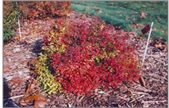
Dakota Goldcharm Spirea in fall

This shrub should only be grown in full sunlight. It prefers to grow in average to moist conditions, and shouldn't be allowed to dry out. It is not particular as to soil type or pH. It is highly tolerant of urban pollution and will even thrive in inner city environments. This is a selected variety of a species not originally from North America.