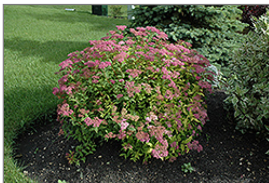
Goldflame Spirea in bloom