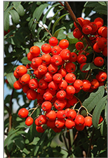
Pyramidal Mountain Ash fruit