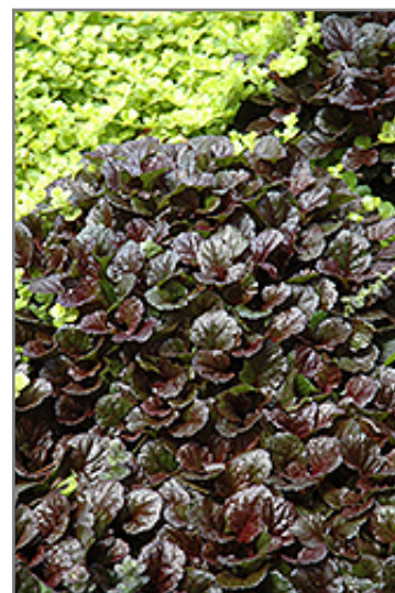
Black Scallop Bugleweed