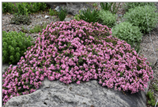
Rose Daphne in bloom