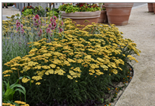
Terra Cotta Yarrow in bloom