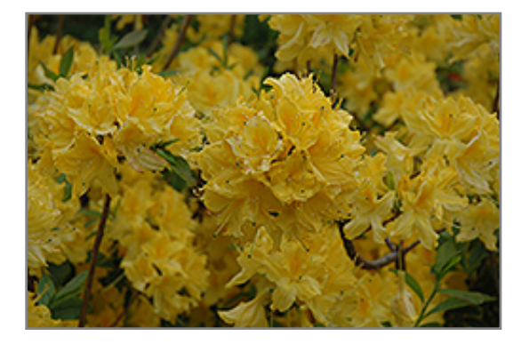
Lemon Lights Azalea flowers