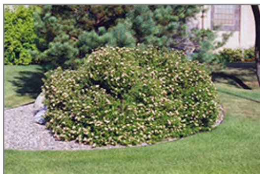
Pink Beauty Potentilla in bloom