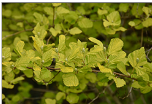
Golden Ninebark foliage