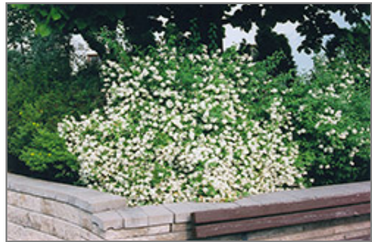
Galahad Mockorange in bloom