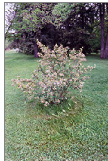
Black Chokeberry in bloom