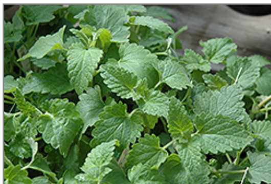
Catnip foliage

Catnip is recommended for the following landscape applications;