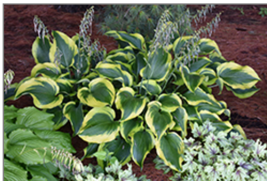
Atlantis Hosta