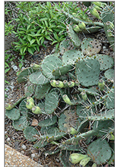
Plains Prickly Pear Cactus