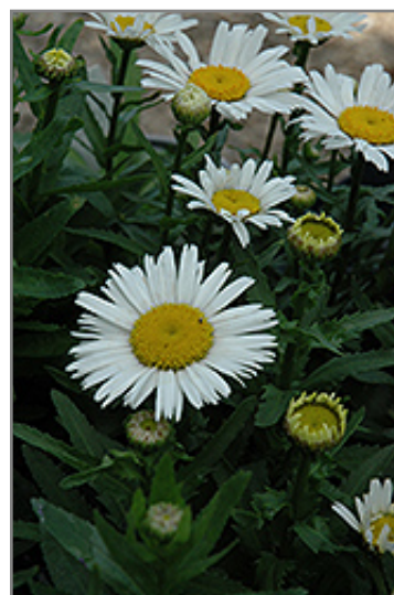
Snow Lady Shasta Daisy flowers