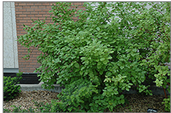
Siberian Dogwood