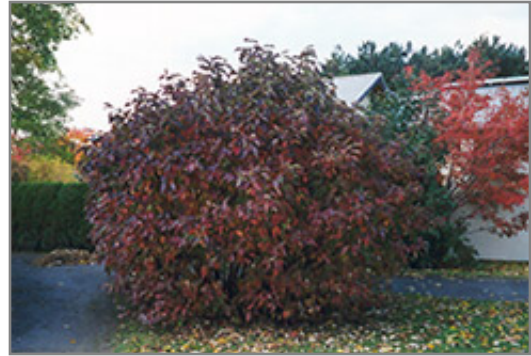
Siberian Dogwood in fall

This shrub does best in full sun to partial shade. It is an amazingly adaptable plant, tolerating both dry conditions and even some standing water. It is not particular as to soil type or pH. It is highly tolerant of urban pollution and will even thrive in inner city environments. This is a selected variety of a species not originally from North America.