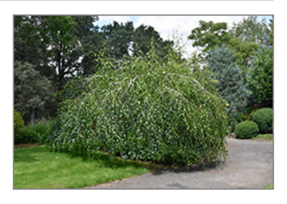
Young's Weeping Birch

Young's Weeping Birch will grow to be about 12 feet tall at maturity, with a spread of 8 feet. It has a low canopy with a typical clearance of 1 foot from the ground, and is suitable for planting under power lines. It grows at a fast rate, and under ideal conditions can be expected to live for approximately 30 years.