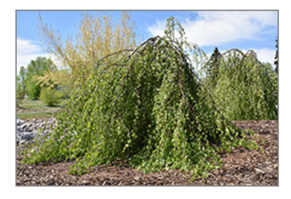
Young's Weeping Birch